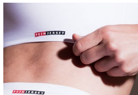
Controlled elasticity, unique strength Stretch fabric, anti-bounce